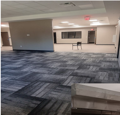
Living / Dining Room

HALLELUJAH!! Our dream has been realized! The Clay Roper Western Arkansas Youth Shelter is now a reality. Isn't it beautiful?